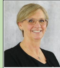
Judy Roach Elementary

Having issues or concerns in your building/program, please email or call: