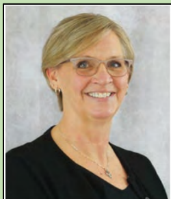
Judy Roach Elementary

Having issues or concerns in your building/program, please email or call: