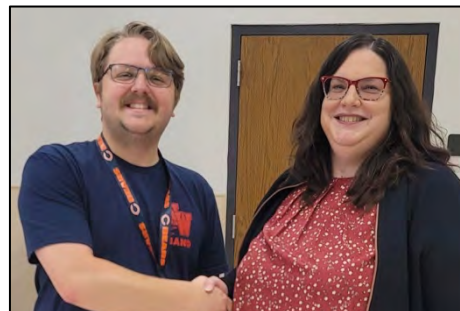
Hunter from Rose Hill Elementary

Having issues or concerns in your building/program, please email or call: