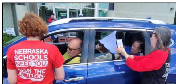
Public School Volunteers collected signatures at an OEA Drive Thru event.

The Secretary of State will forward the petitions to local election officials, who have 40 days to verify the petitions and the signers’ information. Once all petitions have been reviewed and requirements met, the Secretary of State will certify the measure for the November 2024 General Election ballot.